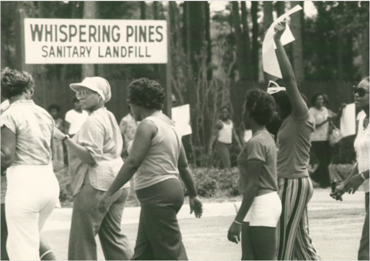
Residents of Northwood Manor protest Whispering Pines landfill in 1979.