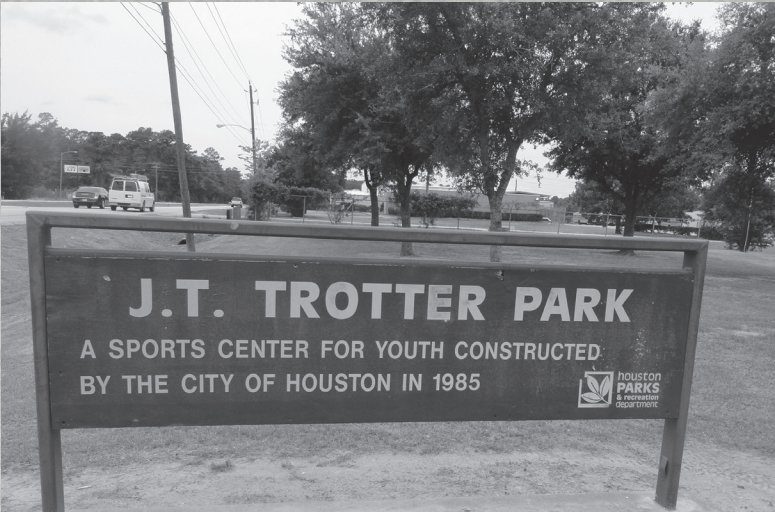
A new city park constructed in 1985 adjacent to Whispering Pines site.