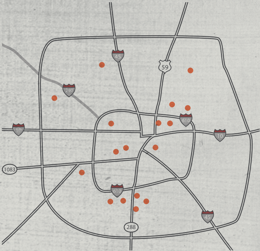
Landfill and incinerator sites in Houston as of 1979.

*The above city-owned solid waste water facilities operated from the 1920s up until the 1970s when the city got out of the landfiling and incineration business. Ethnicity of neighborhood represents the population at the time the facility was sited. Source: Robert D. Bullard, Invisible Houston: The Black Experience in Boom and Bust (1987)