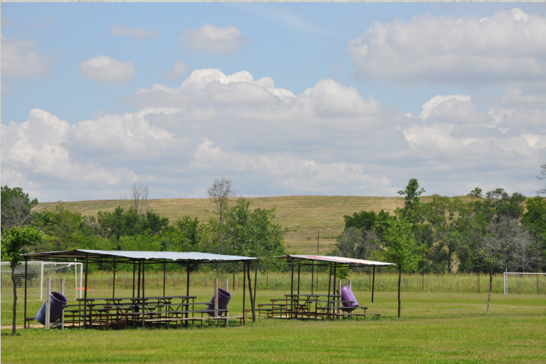
A vast mountain of garbage covered with glass and dirt looms over the park in 2013.